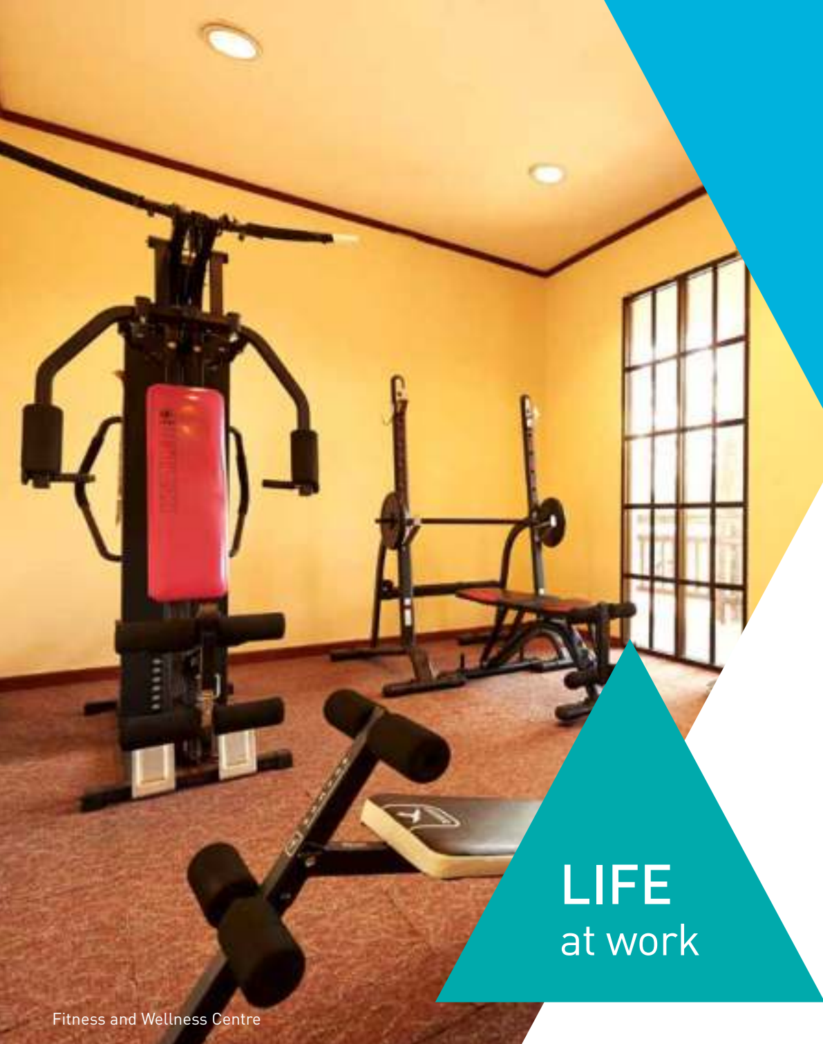
Fitness and Wellness Centre