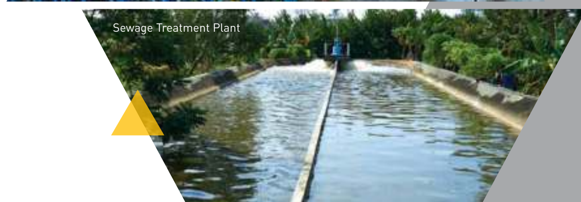
Sewage Treatment Plant