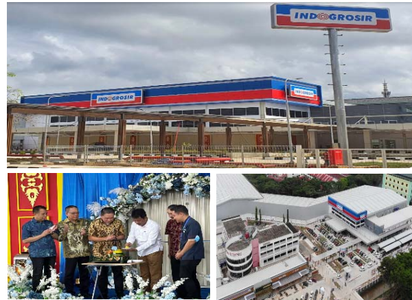
Grand opening of Indogrosir in BIP, Batam on 3 March 2023.