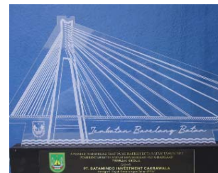
Awards received by BIP for contributing and supporting energy in Batam and BIE for top 3 best halal industrial estate in 2022.