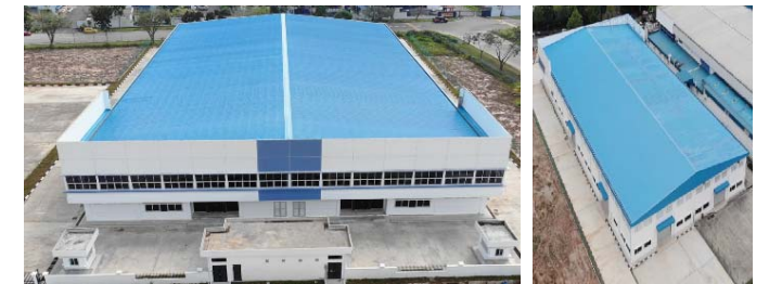
New factories completed and handover to tenants in BIP during 2022.